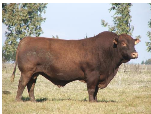
Focus Genetics Stabilizer / Senepol selected for extensive tropical pasture based systems

Creating a highly productive and sustainable large scale beef production and processing operation using world leading skills and technology from New Zealand.