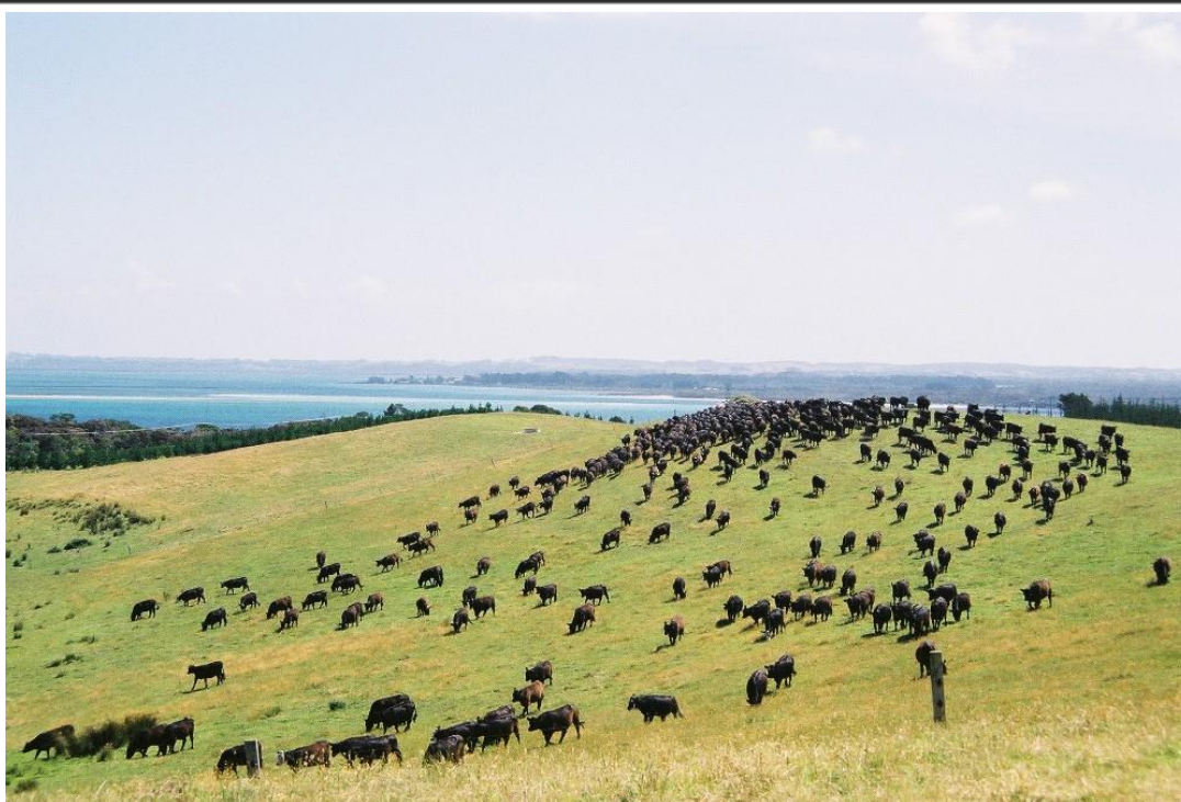
Landcorp Farming, Angus Beef cattle, Rangiputa, New Zealand