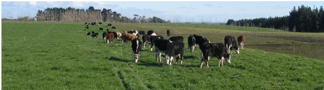
Intensive grazing management systems KIWITECH INTERNATIONAL