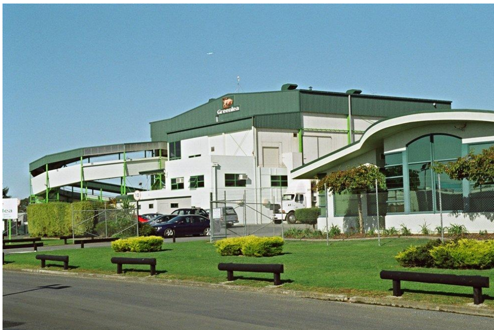
Greenlea Processing Plant, Hamilton, New Zealand

Appropriate beef processing technology for the location which will include remote monitoring equipment for effective management control.