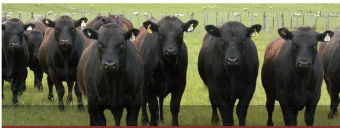
Angus selected for extensive pasture based systems.

Creating a highly productive and sustainable large scale beef production and processing operation using world leading skills and technology from New Zealand.